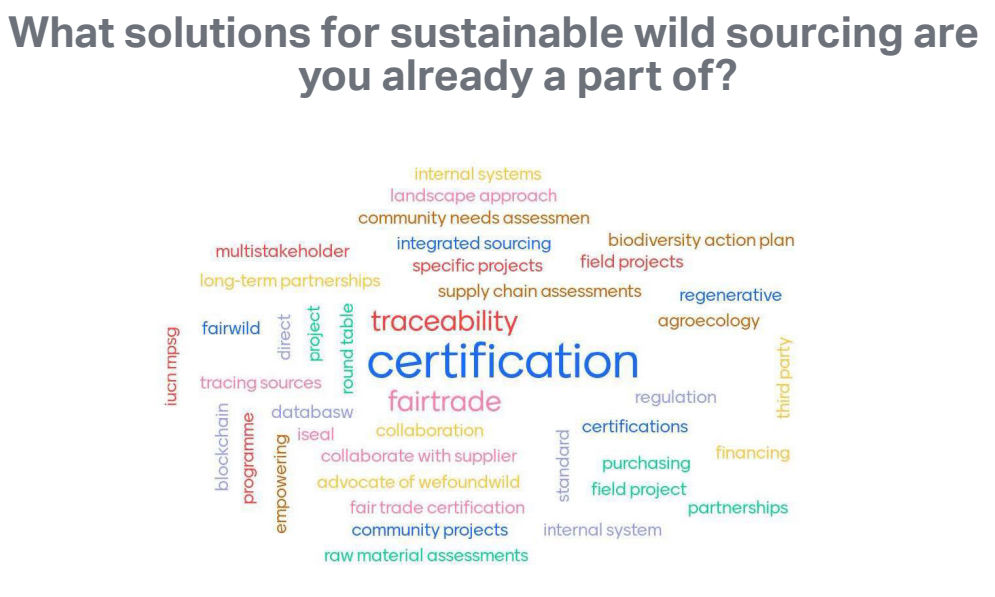
Fig. 2: Attendees were asked to share information on the responsible wild-sourcing initiatives and solutions they are already participating in. The results are captured in the word cloud below.