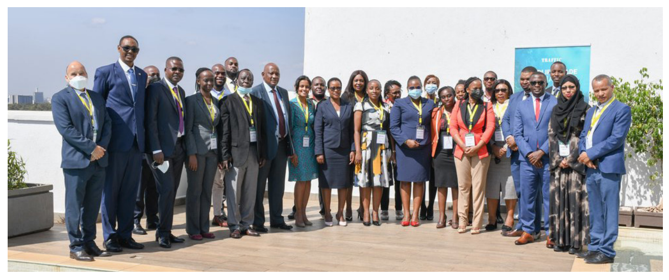
Technical Committee Meeting of the EAAP, March 2022

Building on the ongoing work to understand environmental crimes convergence in Indonesia and to provide helpful information on conservation crimes to law enforcement officials, data from multiple sources related to the convergences of different areas of crime in Viet Nam have been collected since May 2022. This database will be analysed and spatially mapped to improve monitoring and prosecution of the illicit activities of a variety of different actors. Interviews were conducted with law enforcement agencies and other stakeholders, forming the framework for replication in Brazil, Cameroon and Viet Nam.