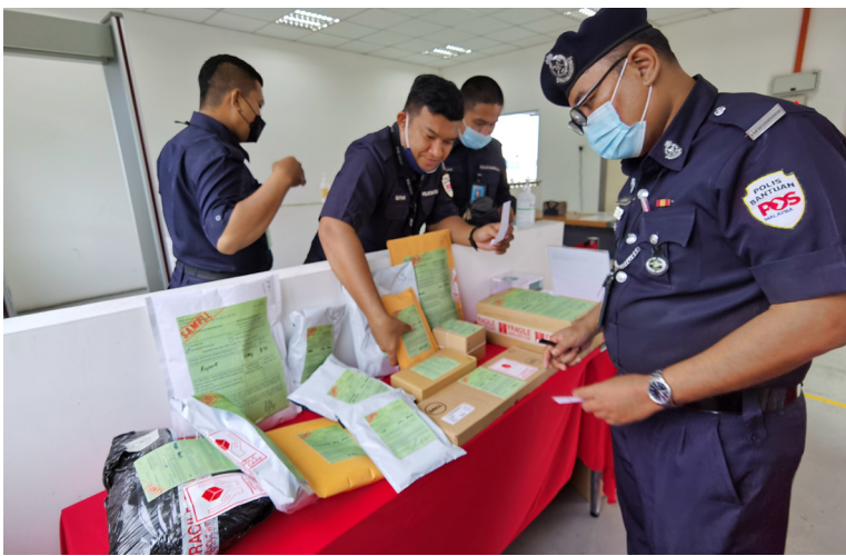
Malaysia Pos frontliners test their knowledge during a training day

hub (Pos Malaysia International Hub). The trainings also developed in-house training capacity, and the training materials have been integrated into the company's online learning platform to carry on capacity-building for the future. Detection of parcels containing illegal wildlife and wildlife products has increased seven-fold since the campaign was implemented. Because of this positive result, the campaign is now being expanded from Peninsular Malaysia to Sabah and Sarawak to