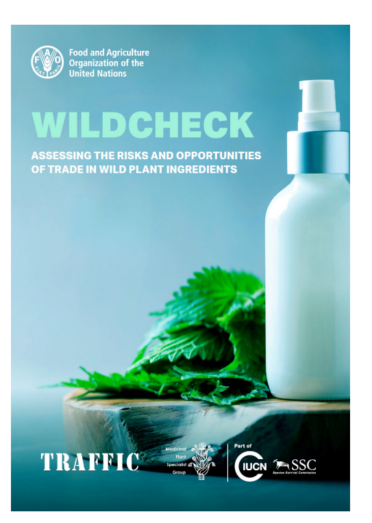
is also anticipated to significantly expand the potential supply of FairWild-certified material to the market.

Also significant to note is that the FairWild Foundation<u>concluded a recognition agreement</u> with Martin Bauer Group for the mabagrown© standard in the reporting period, which has now been formally communicated to industry stakeholders. This represents new and innovative approaches to auditing sustainability practices based on company standards and